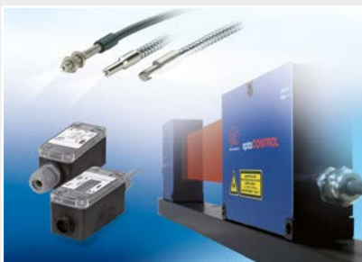
Optical micrometers, fiber optic sensors and fiber optics