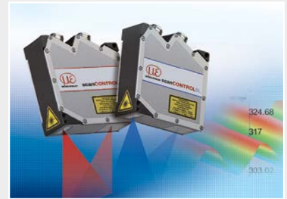
2D/3D profile sensors (laser scanner)