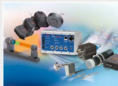
Color recognition sensors, LED analyzers and color inline spectrometer