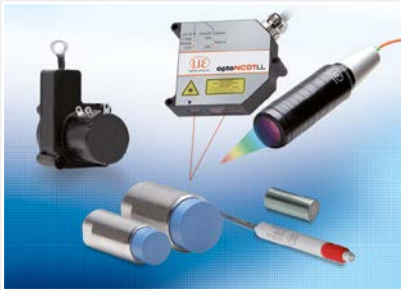
Sensors and systems for displacement and position