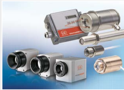
Sensors and measurement devices for non-contact temperature measurement