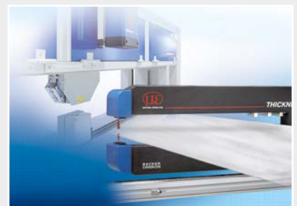
Measurement and inspection systems